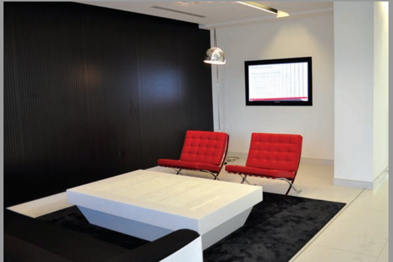
February 2013

Energy efficiency was key as the building is LEED® certified. This is why each meeting room uses a MPC-M5 that is connected to the network and can be consulted via RoomView to get an overview of the room systems. The motion and sound sensors ensure that everything automatically shuts down when the last person leaves the room after the meeting and at the end of the day.